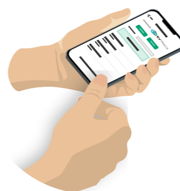
Host Approval For Ad hoc Guests