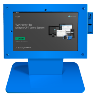
EvTrack Self-Service Touchscreen Kiosk